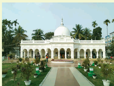
Madan Mohan Temple