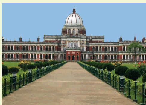
Cooch Behar Palace

Cooch Behar district is located in the northeastern part of West Bengal bordering Assam and Bangladesh. Cooch Behar town, the head quarter of the district which is mainly famous for the Kochbihar Palace, noted for its elegance and grandeur. Idealized from the concept of classical European style of Italian Renaissance, this magnificent palace was built by the famous Koch king Maharaja Nripendra Narayan in 1887. Another attraction is the Madan Mohan Temple situated in the heart of the Cooch Behar town; constructed by Maharaja Nripendra Narayan during 1885 to 1889. Sagardighi, the huge tank situated in the middle of Cooch Behar Town is also a tourist attraction. It is a popular rendezvous in the evening surrounded by heritage buildings. Rasikbil, Kholta Ecotourism Spot, Rajpat Mound, Chilapata Reserve Forest, Gorumara National Park, Jaldapara National Park and Jaldapara Wildlife Sanctuary are popular tourist destinations nearby and can be visited within a day from Cooch Behar. Dooars, Bhutan, Darjeeling or Gangtok can also be approached from here requiring three days.