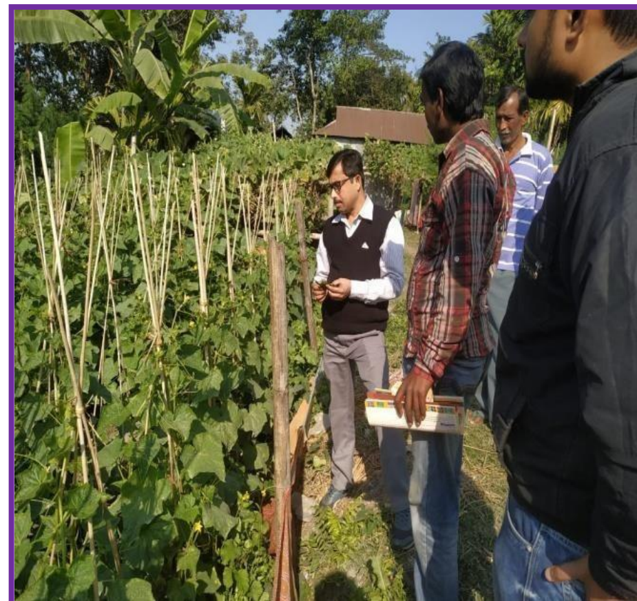
Cucumber field infested by White fly (07.12.2019 at Madhupur, Coochbehar-II)