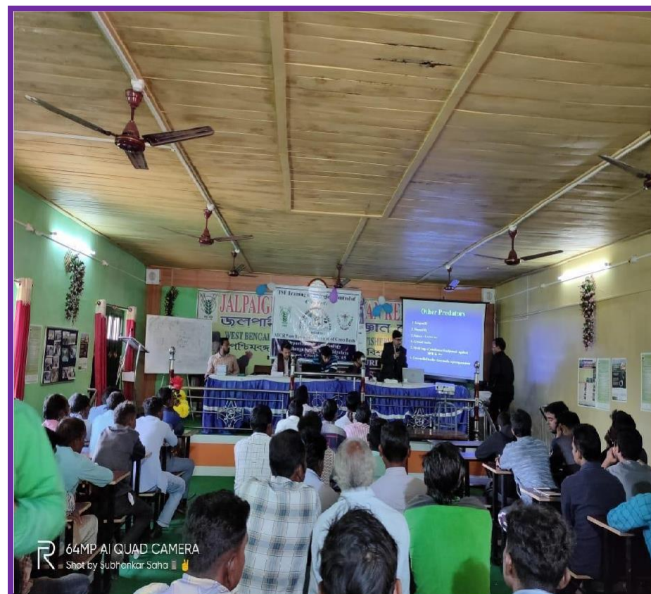
Training programme on Biological Control (31.12.2019 at Ramsai, Jalpaiguri)