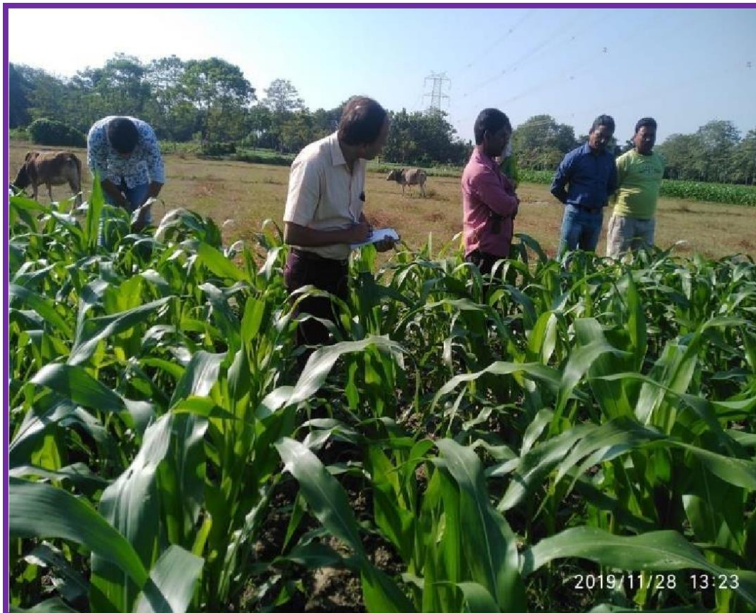
Maize field infested by Fall armyworm (28.11.2019 at Raichenga, Alipurduar)