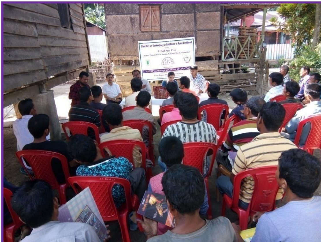
Field-day on Beekeeping (12.11.2019 at Kalchini, Alipurduar)