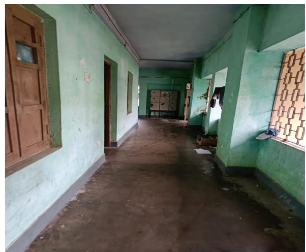
Clean corridor in Boys' Hostel