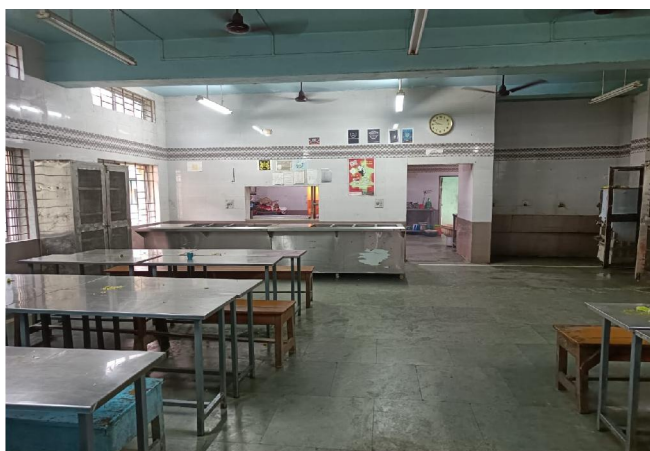
Dining Hall of Boys' Hostel (PCM Hall)