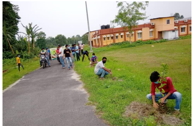
Students are planting trees in the campus premises during Environment Day celebration 2020