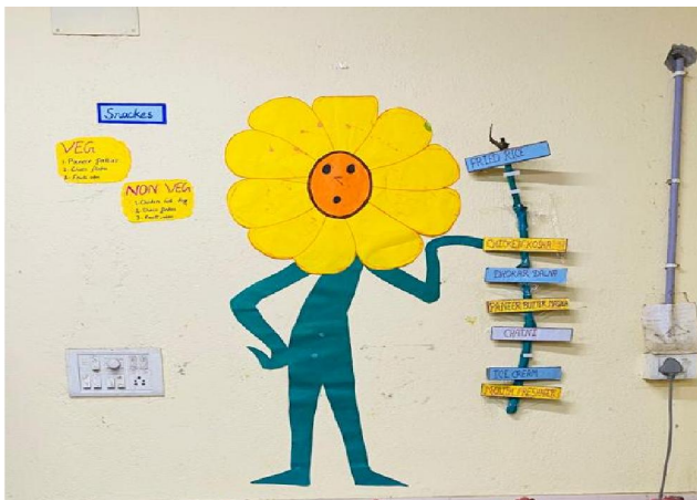
Paper craft in Hostel Dining