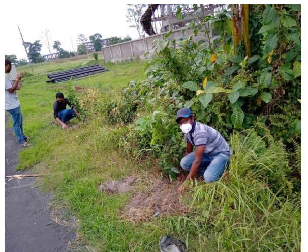
Plantation programme by the students