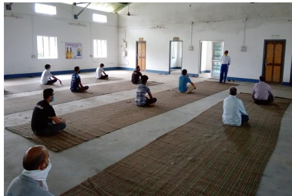
Glimpses of International Yoga Day 2020