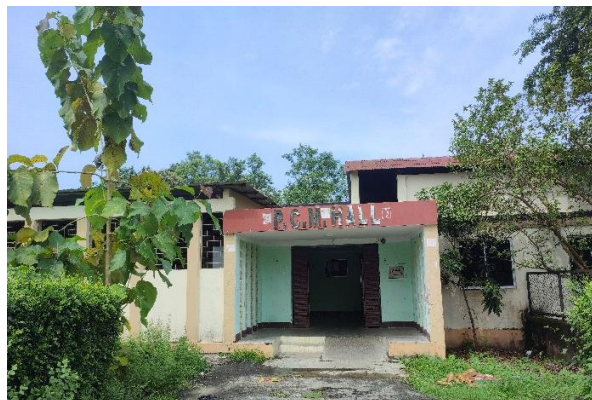
Entrance of P. C. M. Hall (UG Boys' Hostel)