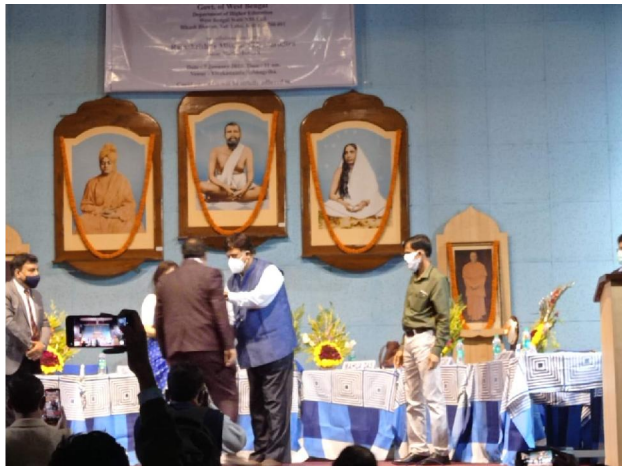
West Bengal NSS awards programme