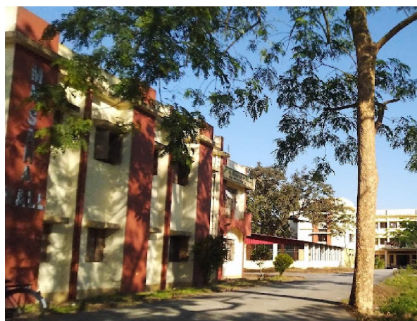
M. N. Saha Hall (PG Boys' Hostel)