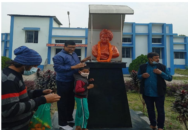
Celebration of birth anniversary of Swami Vivekananda