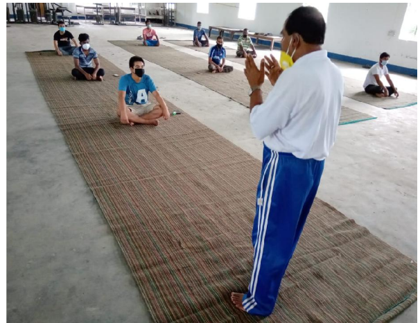
Yoga exercise for the students