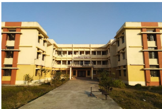
S. B. C. Hall (PG Boys' Hostel)