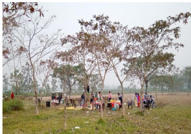
Picnic of Office staffs as a part of their amusement