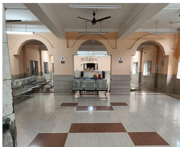
Common room in Boys' Hostel (PCM Hall)