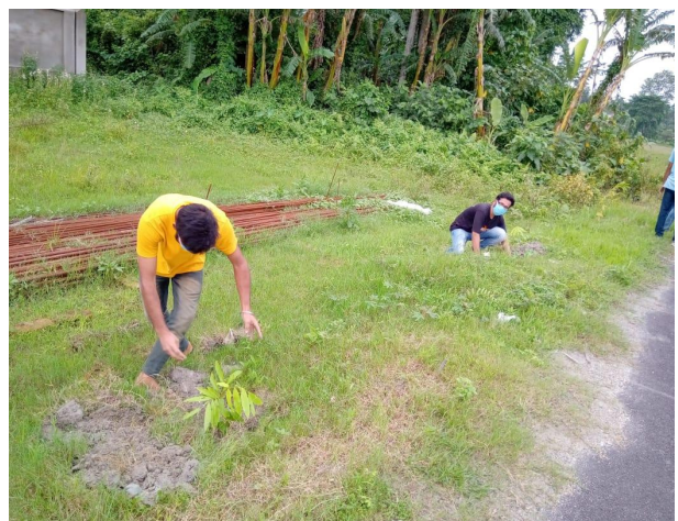
Plantation drive by the students