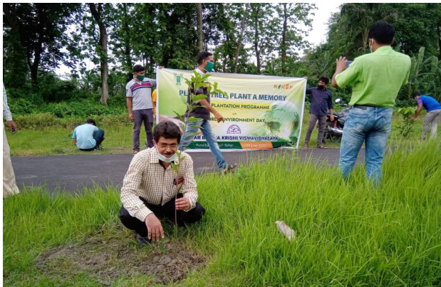
Dean, faculty of Agriculture planting trees during the celebration of World Environment Day 2020