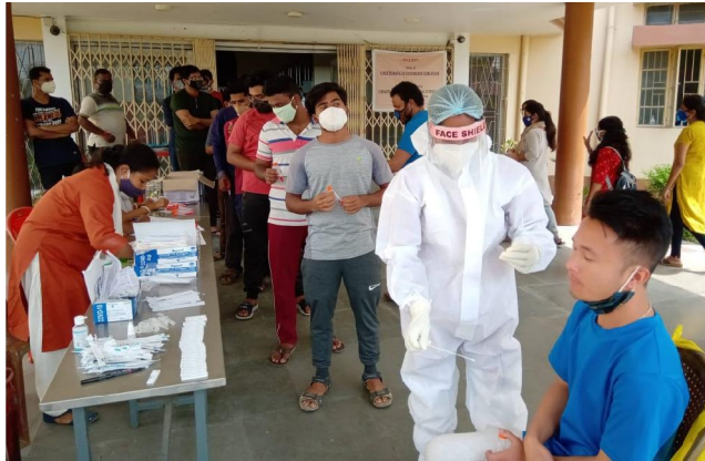
RT-PCR test of COVID 19 in the campus