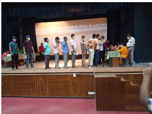
COVID 19 vaccination programme in the campus