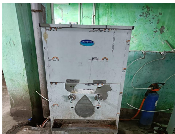
Water purifier cum cooler in Hostel