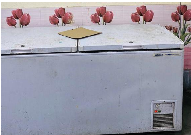
Deep freezer in Hostel Kitchen