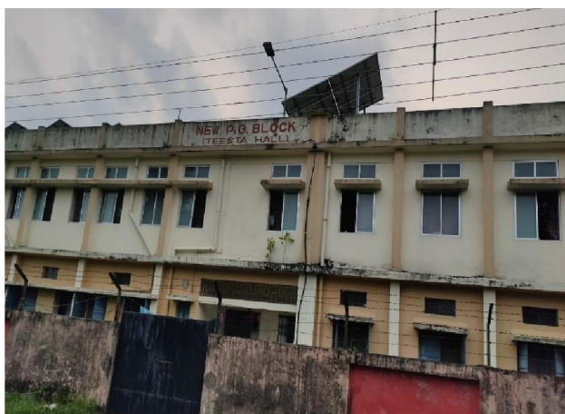
Teesta Hall (Girls' Hostel, New PG Block)