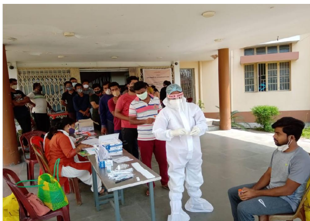
Sample collection for COVID 19 RTPCR test in the campus