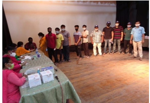
COVID 19 vaccination camp in the campus