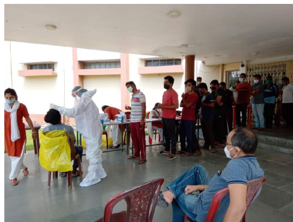
Sample collection for COVID 19 RTPCR test in the campus