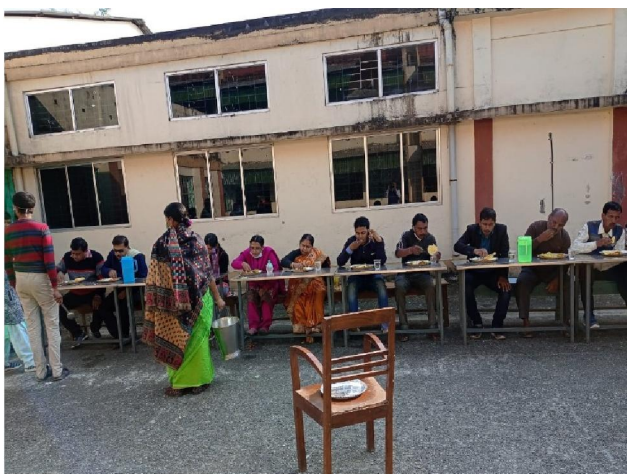
Picnic time for the staffs