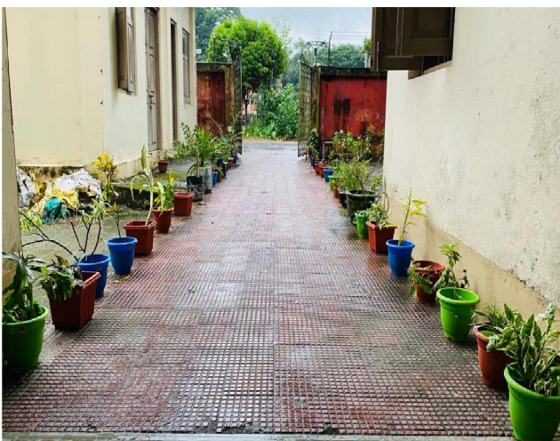
Entrance of Girls' Hostel (Teesta Hall) decorated by the girls