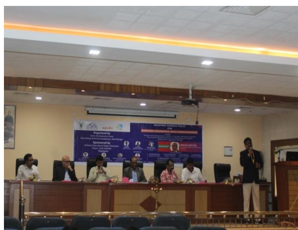
Webinar on career opportunities organized by CDC, UBKV