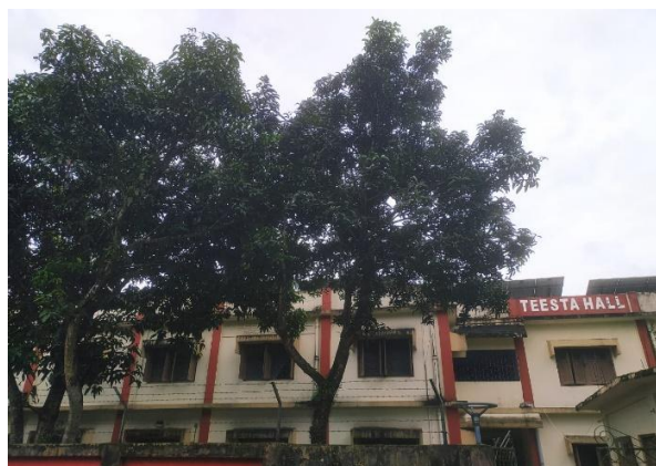
Teesta Hall (Girls' Hostel)