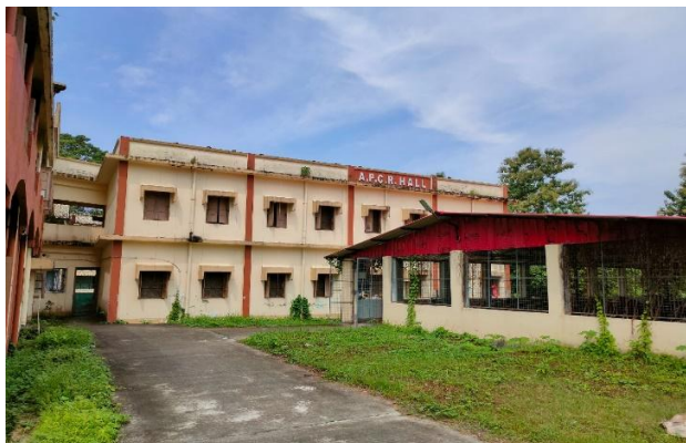
A.P. C. R. Hall (UG Boys' Hostel)