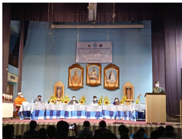
West Bengal NSS awards programme