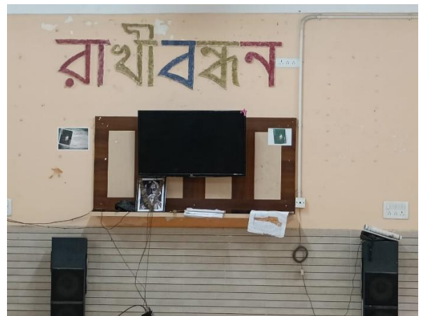
Common room at Boys' Hostel