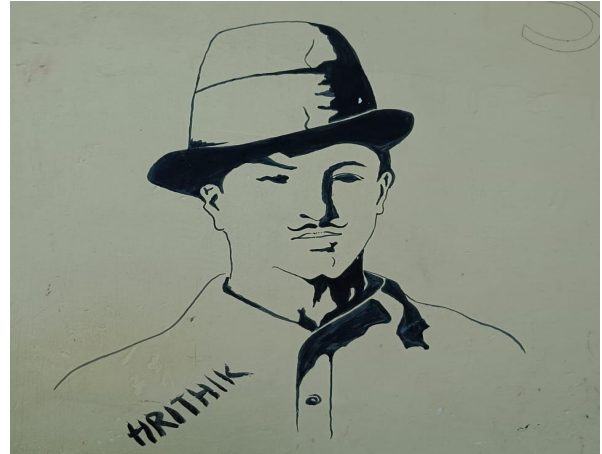
Wall painting in Hostel by the students