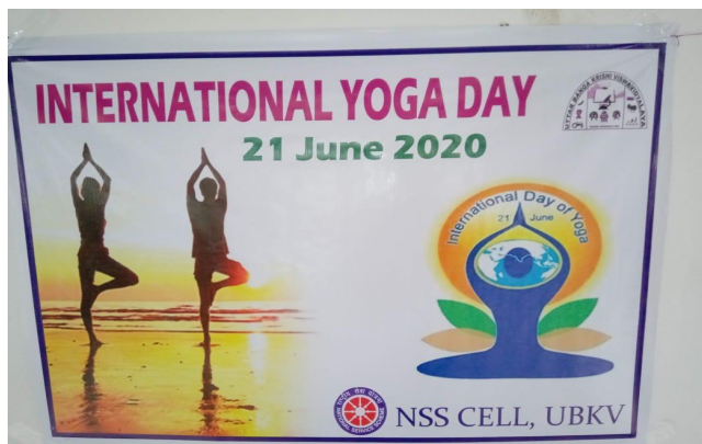
Celebration of International Yoga Day 2020