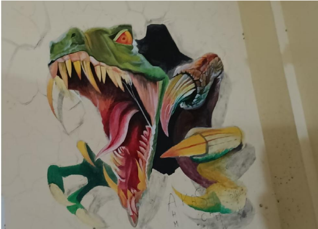
Wall painting in Hostel by the students