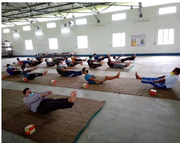
Yoga exercise by the students and staffs of the University