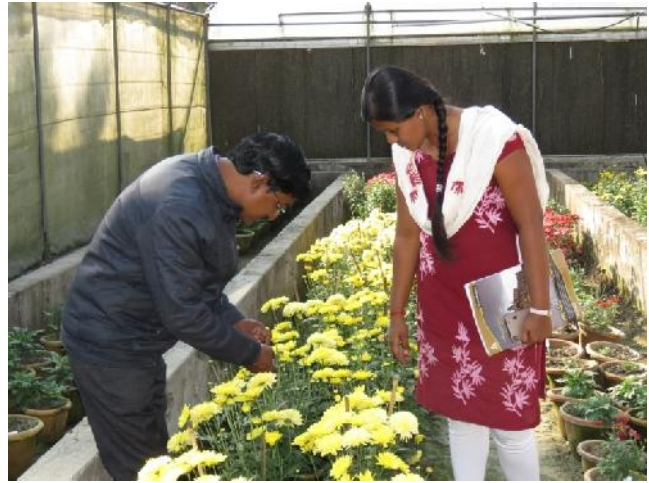
Maintaining Chrysanthemum germplasm