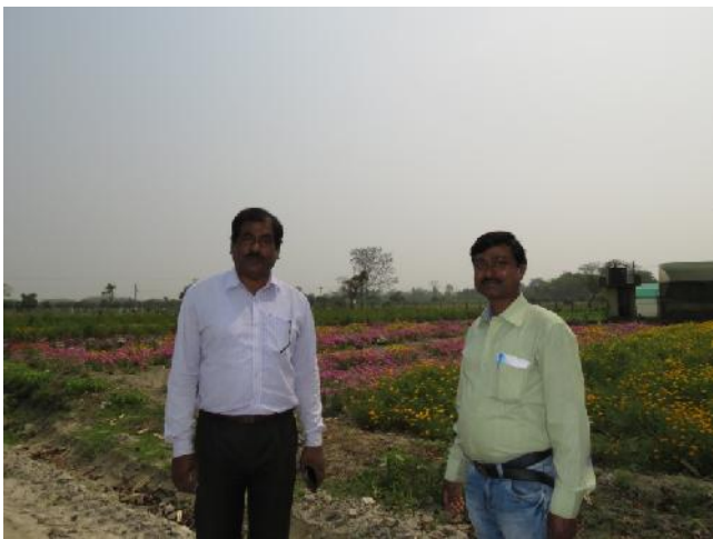
Production of winter annuals in the instructional farm