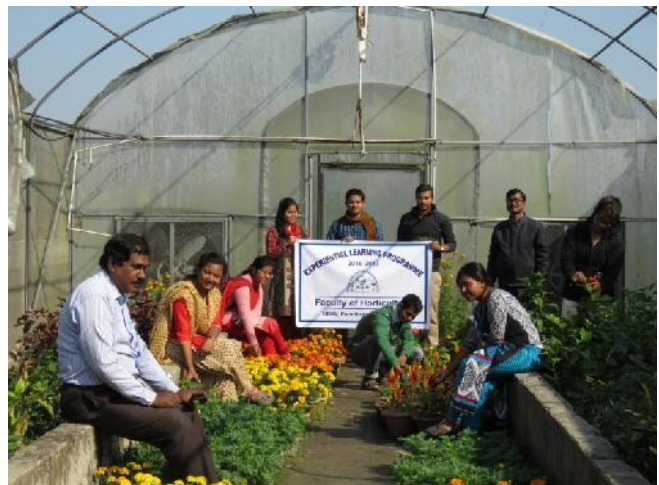
Raising of saplings of ornamentals under ELP