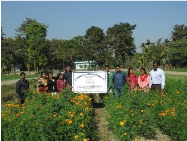
Production of Marigold under ELP