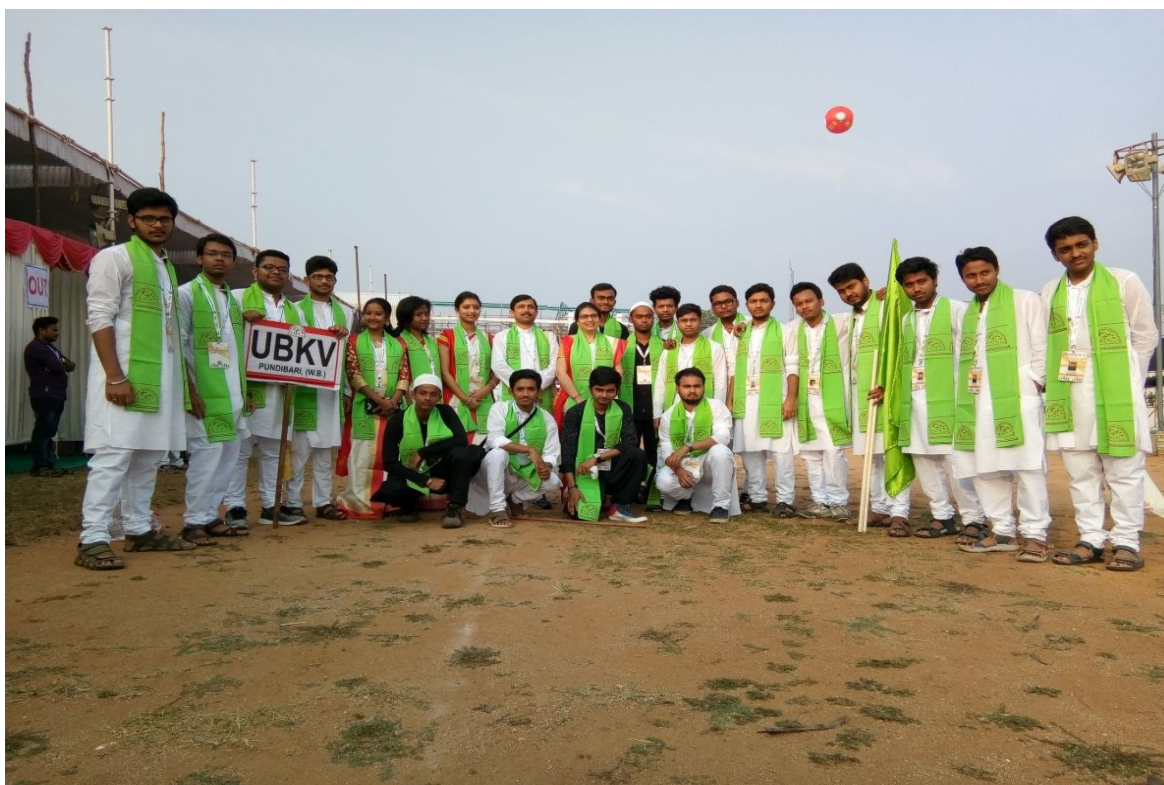
Participants and Teachers of UBKV during AgriUnifest 2018 at Tirupati during 12 to 16 th February, 2018.

Different events are mentioned hereunder: