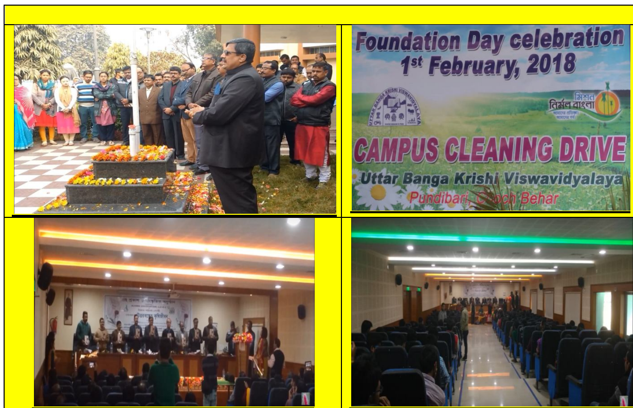
University Foundation Day 1 st February, -2018