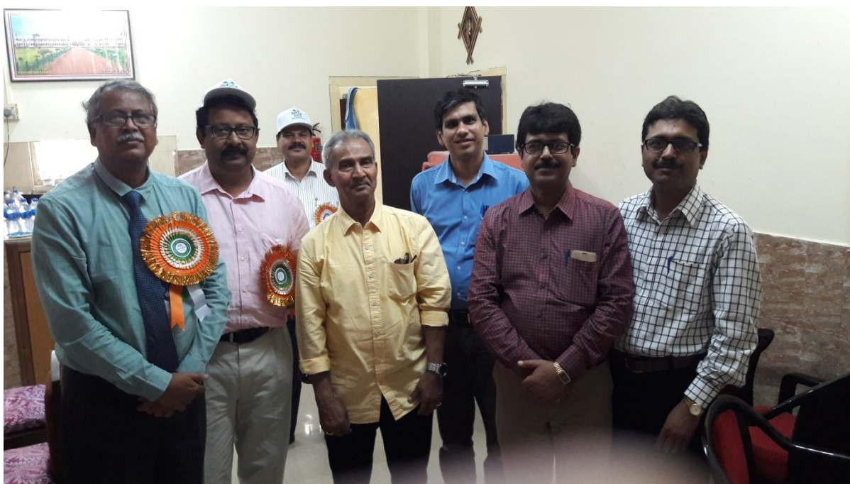
Annual Athletic Meet (9 th March,2018)