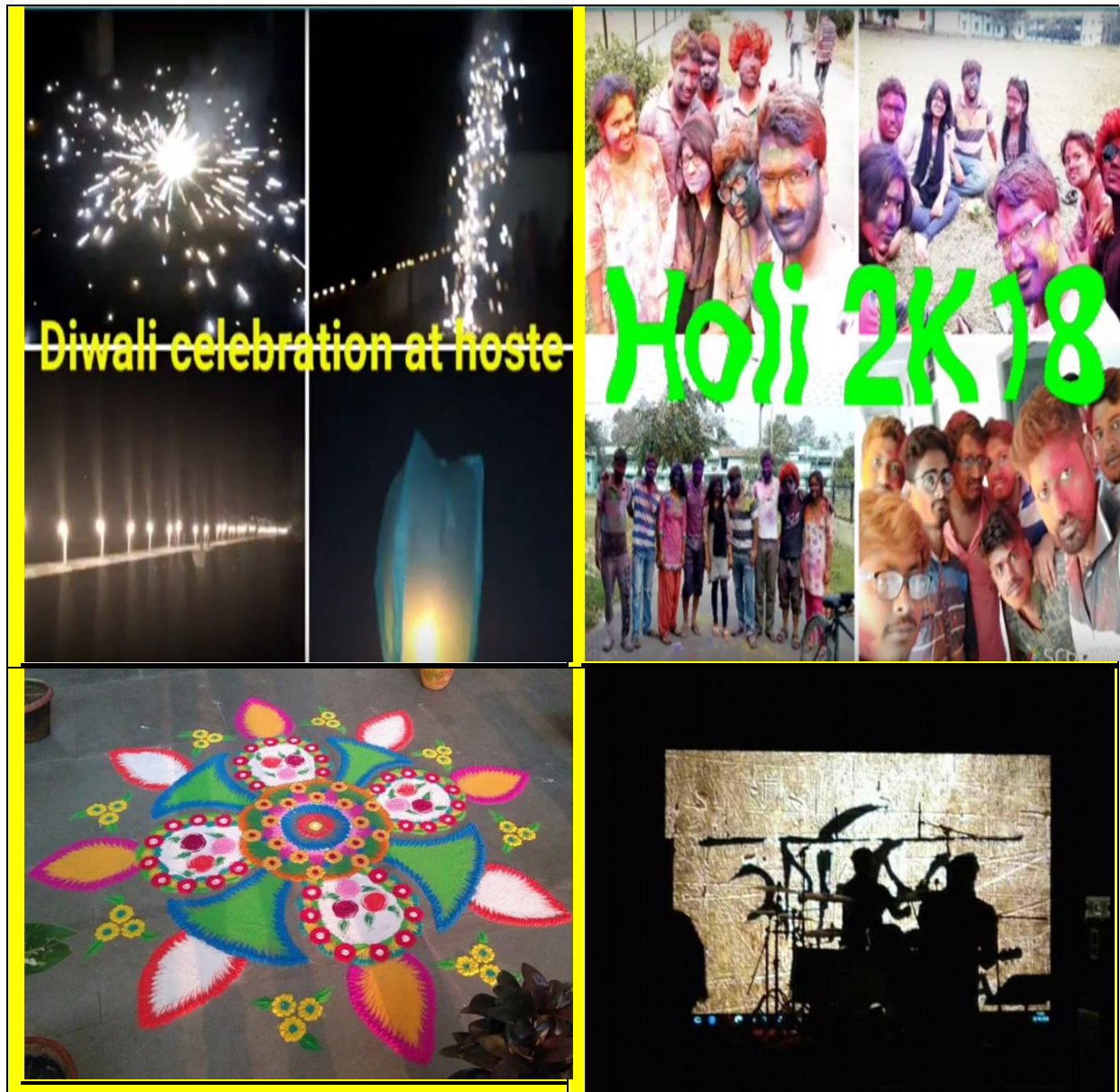
Diwali celebrations and Holi utsab by the students

Like every year this year, the Viswakarma Puja was also organized under the umbrella of DSW, where role of students and teachers under the Technology faculty were in forefront.