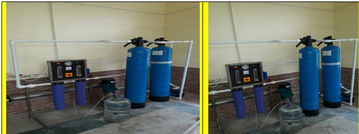
Reverse Osmosis (RO) Water Purifier installed in PCM, M N Saha, Teesta and S B Chattopadhyay Hostel, so as to provide safe drinking water to all boarders of UBKV.

students are provided with single/double/triple seated room. Each hostel is connected with generator connection to provide uninterrupted power supply.