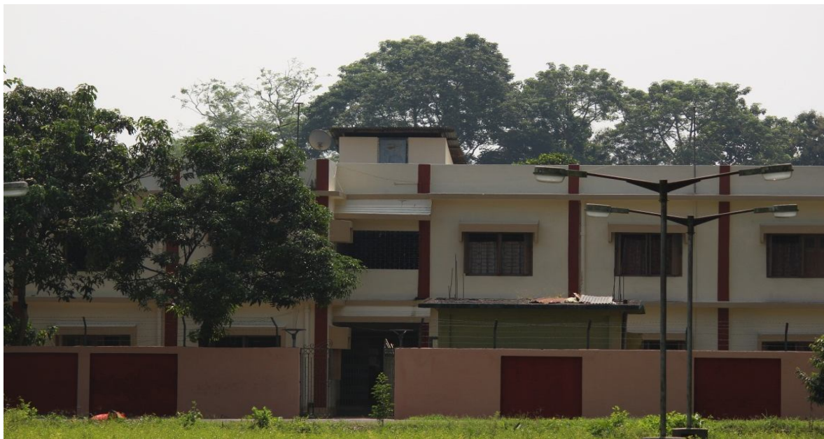
Side view of Girls' hostel (Teesta Hall)

Unlike boys hostels, there is one hostel for girls' student (Teesta Hall) having three wings/sectors allotted for UG, PG and Ph. D students. In total this hall has 74 rooms to accommodate girl students. Recent trend shows a sharp hike of girl's enrolment in UBKV. The International hostel having 12 rooms has been allotted for UG 1 st year for the session 2018–19 to accommodate all girl students. Addition of more rooms is on priority to keep pace with the time and trend.