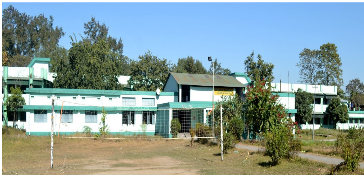
Front view of PCM Boys' Hostel

This hostel is with a capacity of 200 student boarders. The hostels have different wings i.e. three halls as PCM Hall with 42 rooms, APCR Hall with 20 rooms, and APCR Extension Hall with 13 rooms. During this current year, 230 boarder are residing at this hostel.