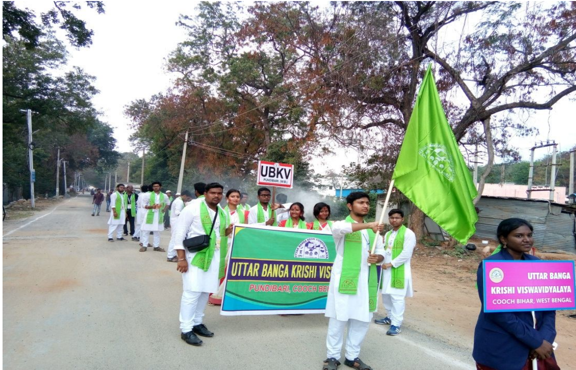
During morning rally at Tirupati

After official inauguration, a morning rally was celebrated in and outside the university campus at Tirupati with all the participants throughout the country. Each university student performed during the morning rally with their local culture and beauty. Our student performed during that rally on the rhyme "Unity in Diversity".