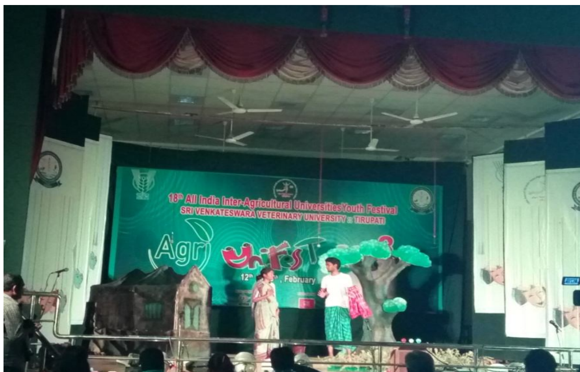
One Act Play at Tirupati

Nine students of 1 st , 2 nd and 3 rd year participated in the one act play on the theme “Freshness and Pollution” in the AgriUnifest 2018. They performed well in that event.