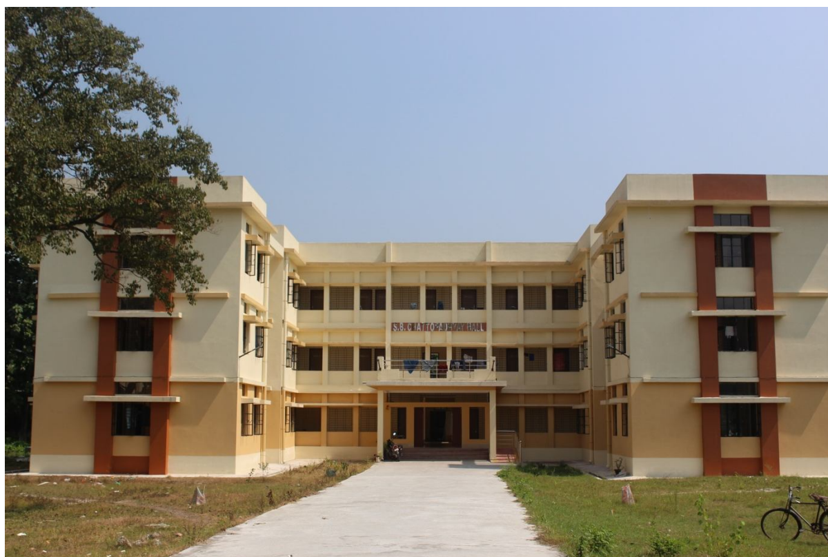
S.B.Chattopadhyay Hall (New P.G.Boys' Hostel)