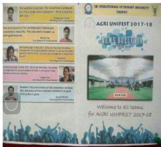
Published News Bulletin with the statements of our students