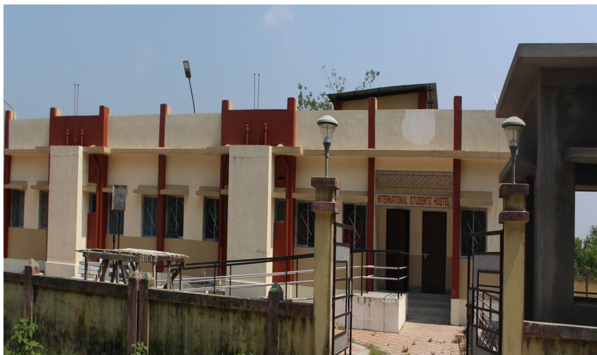
International Students' Hostel