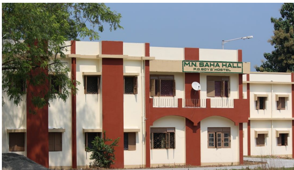
Front view of M. N. Saha Hall

This Hostel is with a capacity of 90 student boarders. It is located between the University canteen and under graduate boy's hostel. This hostel have only one hall namely M N Saha hall with 30 rooms. Another PG hall (S.B.Chatyopadhyay ) with a boarder capacity of 72 has been established in 2018.