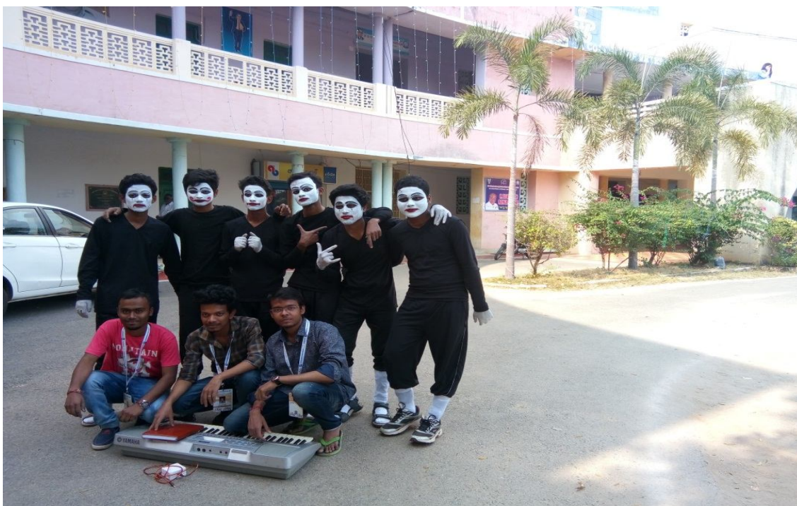
Students of UBKV after the mime