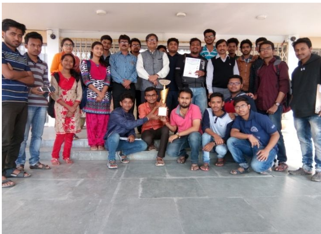
Hon'ble VC, DSW, participants and teachers with the Memento and Certificate at ATIC building, UBKV