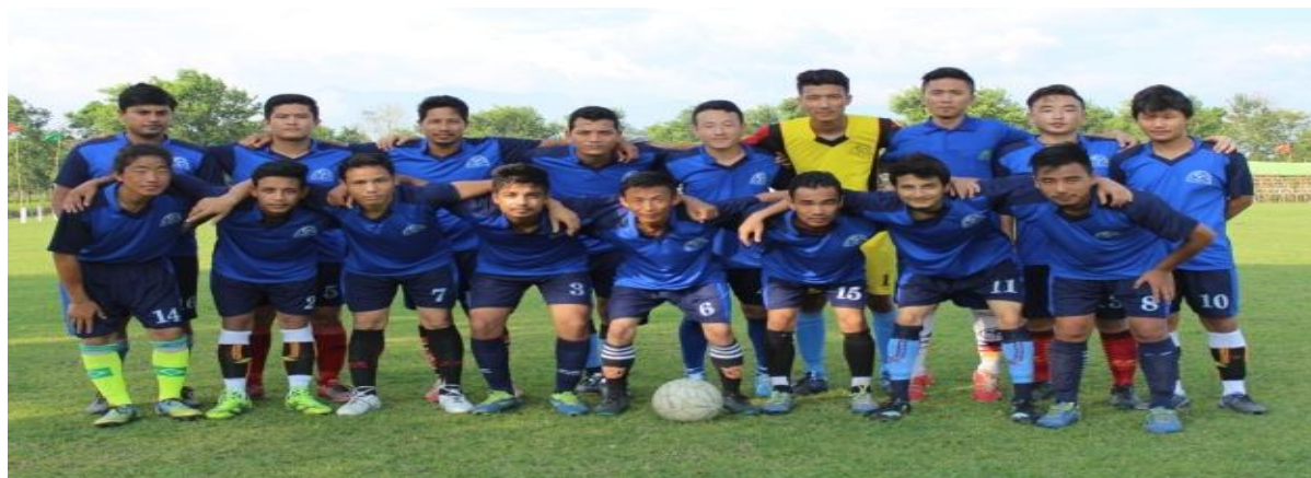
University Foot Ball team in action