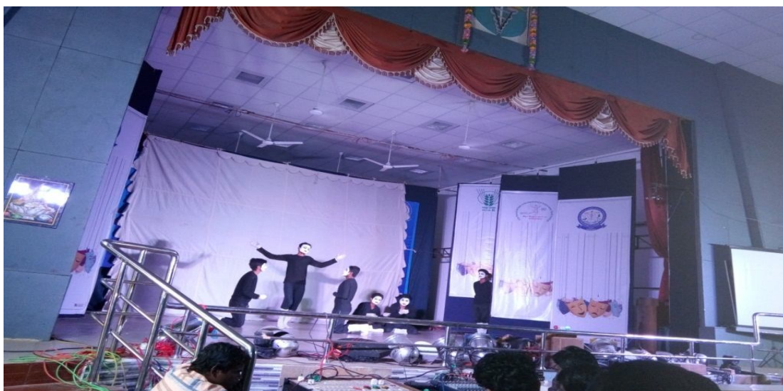
UBKV Students performing mime on the theme “Indian Religion”

Mime: In this event five students from 1 st , 2 nd and 3 rd year under graduate Agriculture and Horticulture faculty had participated and they performed well on the theme “Indian Religion”.