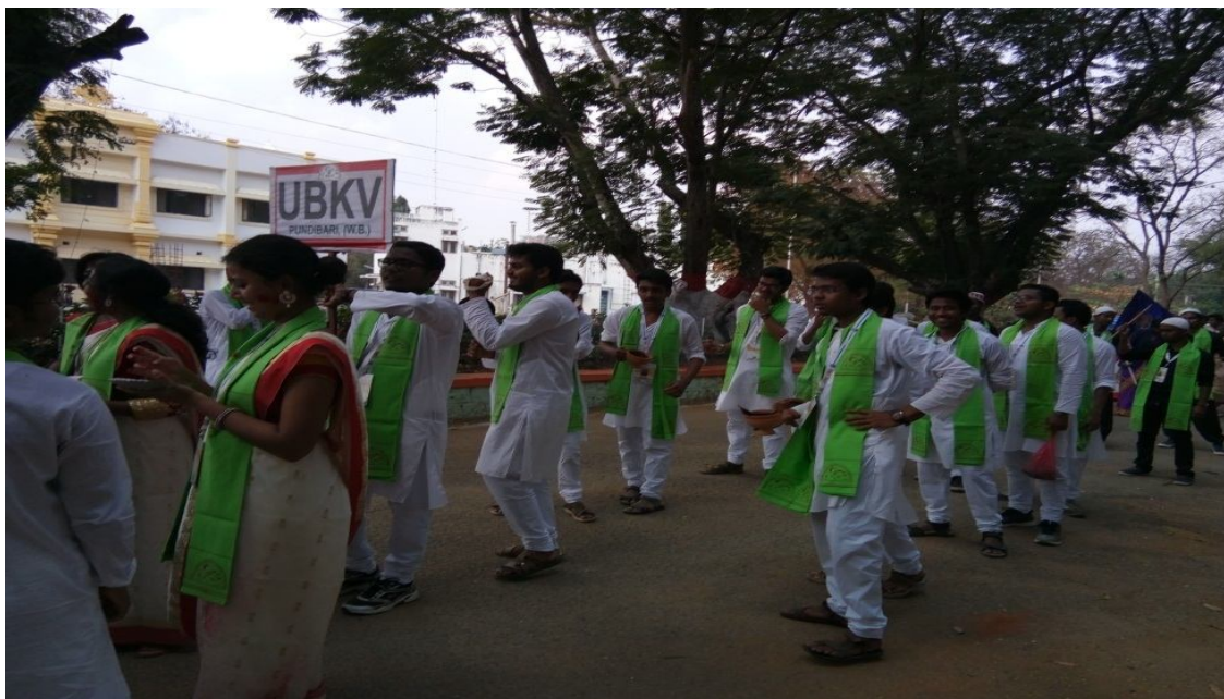
Dhunuchinach during morning rally at Tirupati