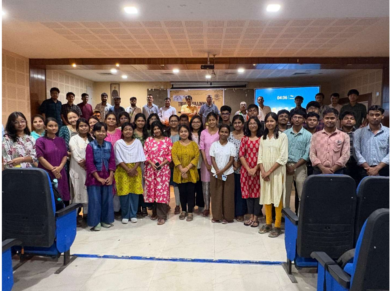
3 NEP-SAATHI WITH FACULTIES AND PARTICIPANTS AND AUDIENCE