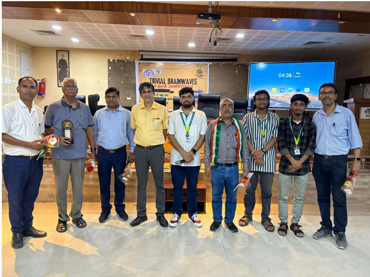
3 NEP-SAARTHI WITH FACULTIES AND NEP Co-Ordinator